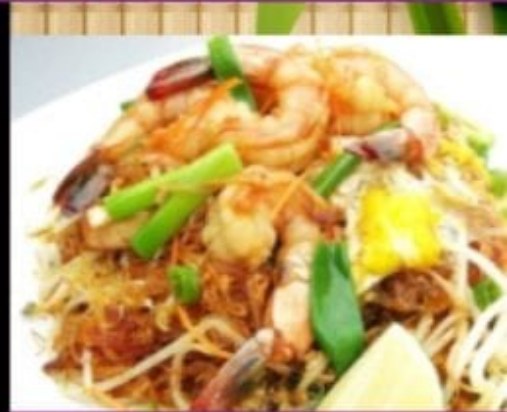
CHICKEN WOONSEN PHAD THAI

One of the most famous Thai dish. Deep fried fresh whole snapper or Filet topped with a spicy chili, bell peppers and garlic sauce.