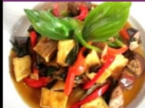
EGGPLANT AND TOFU EMERALD