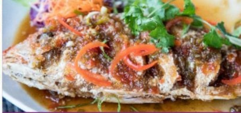
THREE TASTE FISH