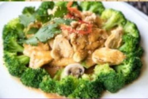
PARAM STEAMED CHICKEN

All entrees are served with white jasmine rice (except noodle or fried rice dishes) Extra white jasmine rice thereafter will be $2, Brown rice substitution will be $1