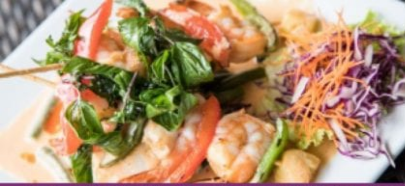
PAN-SEARED SEA BASS AND GRILLED SHRIMP