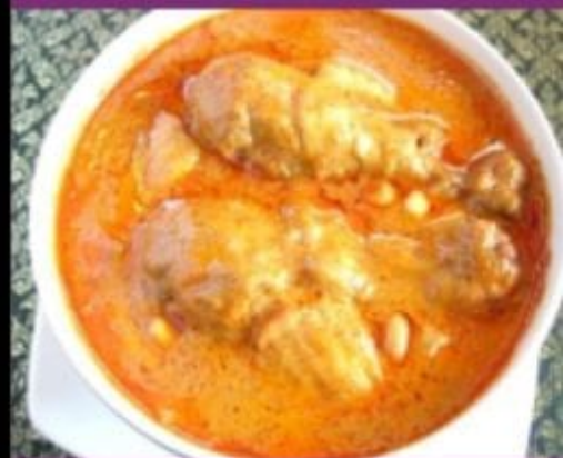
MASSAMAN CURRY SUPREME