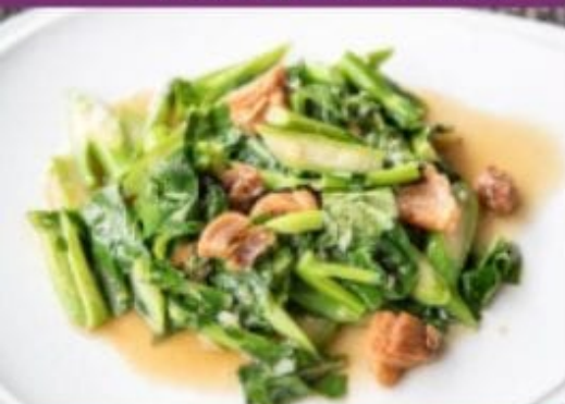
KANAH MOO KROB

Thai Thani's homemade peanut sauce served over steamed chicken and lightly braised carrots, mushrooms, baby corns, broccoli, snow peas, and sesame seed on top.