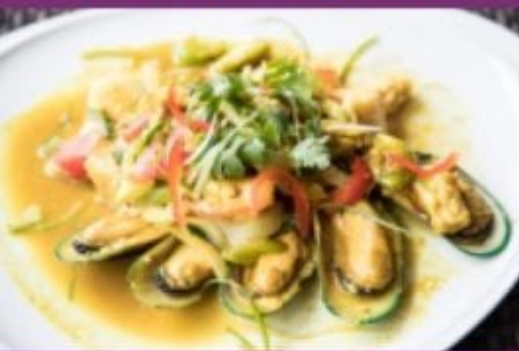
PHAD POONG KAREE

Seared Sea Bass served in a light red curry tossed with string beans, red and green bell peppers topped with fried basil and garnished with grilled shrimps.